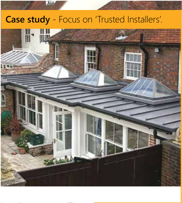
Case study - Focus on 'Trusted Installers'.