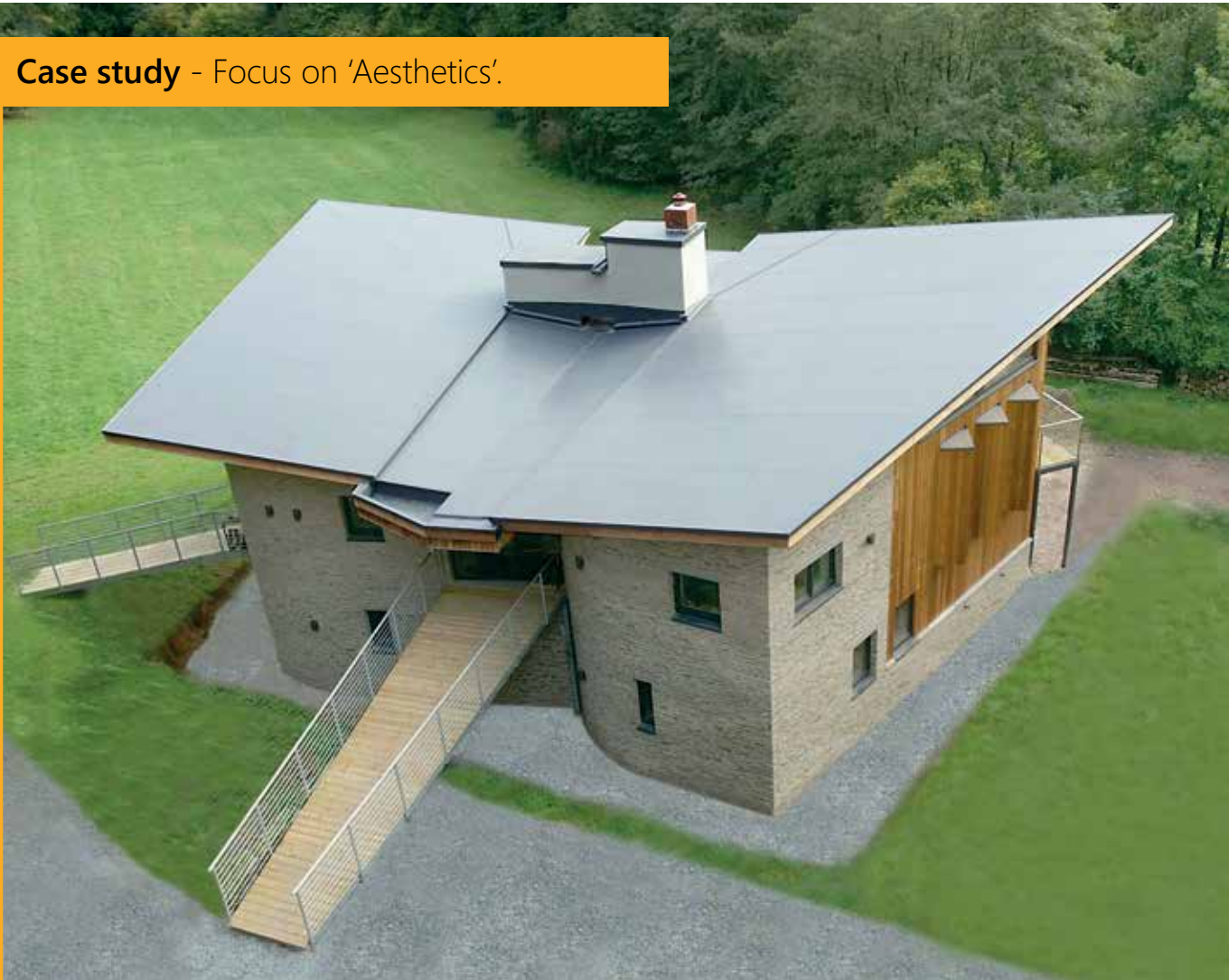
Case study - Focus on 'Aesthetics'.

This Grade II listed building is located in a West Sussex conservation area. The homeowner was very aware of the potential theft risk to the new roof that installing traditional lead would create. Through discussion with the planning and conservation agencies, approval was granted for a Sarnafil roof in lead grey with matching batten roll profiles to be installed to ensure the traditional features of the property were maintained. Additionally, the extravagant costs associated with lead materials, and the difficulty to find trained and qualified installers made the choice simple. Roof Assured by Sarnafil fulfilled the criteria, giving the homeowner a substitute which offers greater value for money, that met Planning Authority consent for this project, and most importantly was supplied and installed by approved, trained and qualified, Registered Installers.