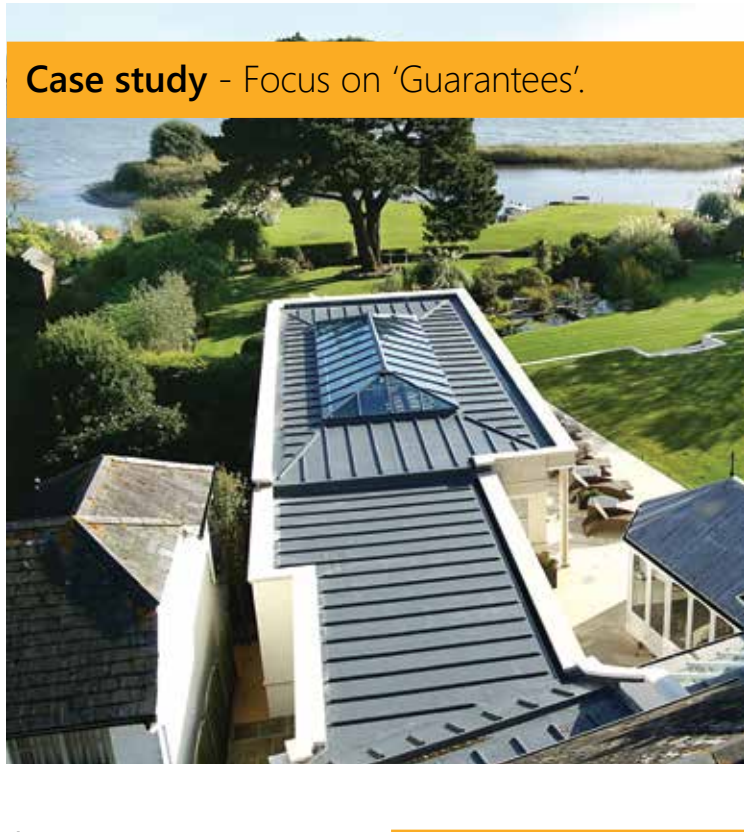
Case study - Focus on 'Guarantees'.

“We understand that a roof can define the look of your home...”