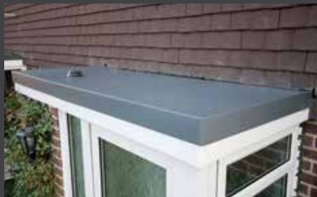
DORMERS AND PORCHES