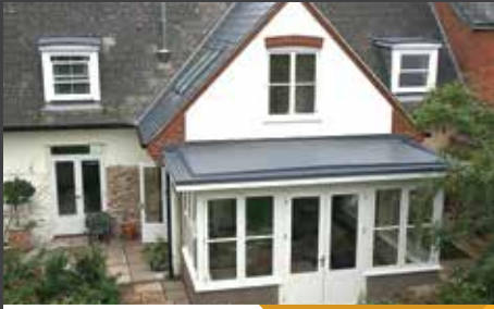
HOMES AND EXTENSIONS