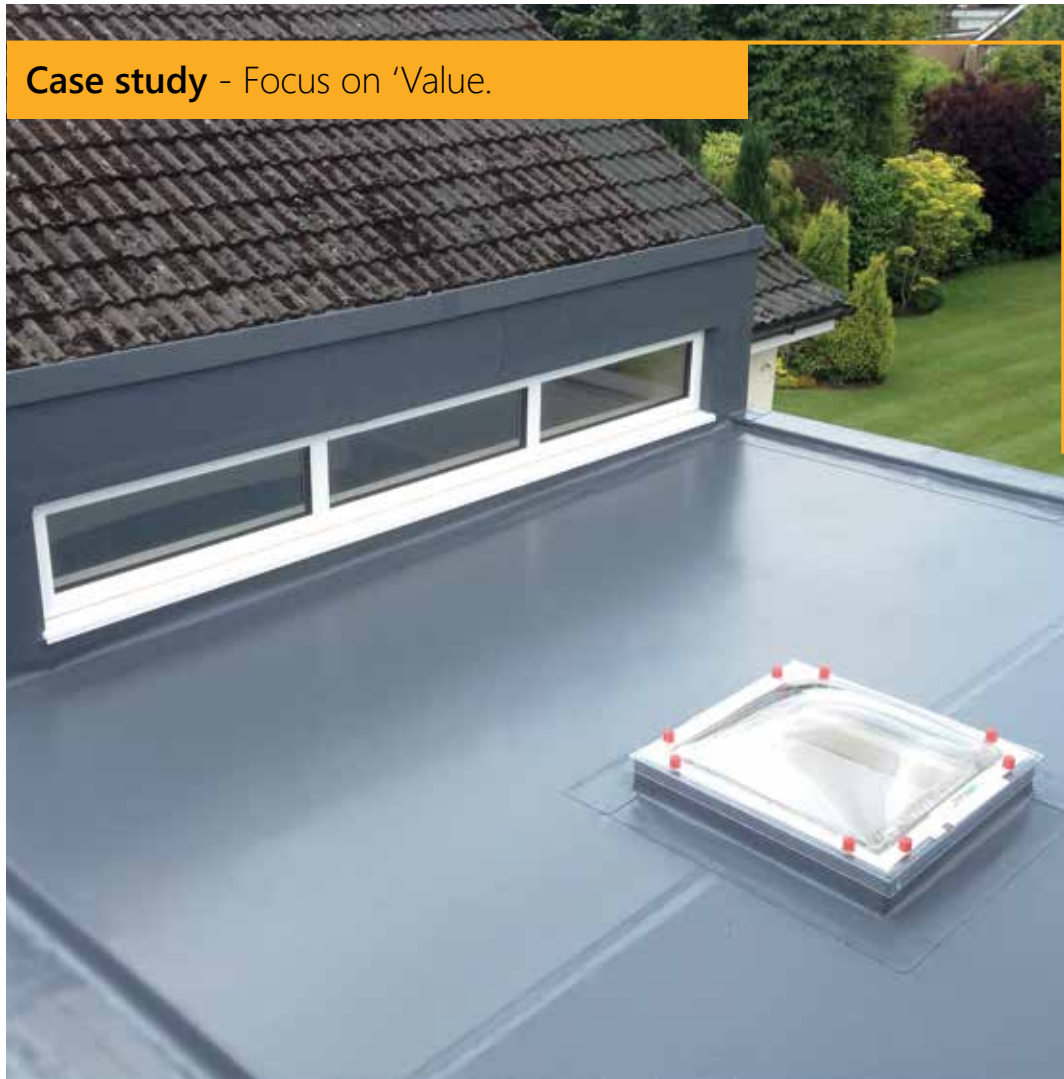
Case study - Focus on 'Value.

“An efficient combination that provides long term cost savings for your home...”