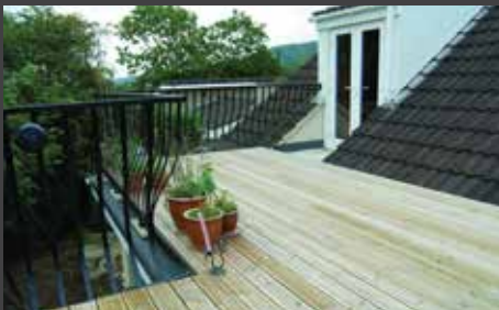
ROOF TERRACES AND BALCONIES