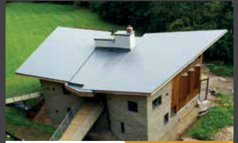
SELF BUILD AND RENOVATION